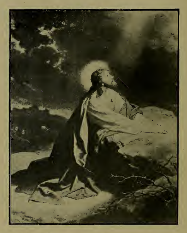
"By what sign shall I overcome the powers of the earth?" The Within: "By the sign of the Son of Man." "Show thou me this sign."